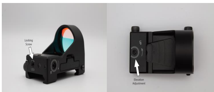
Locking Screw Location

Model: Ultradot L/T Finish: Black Matte only Body Material: Aluminum Dot size: 4 MOA Magnification: 1X Battery: CR2032 Brightness level: 10 positions Parallax Free: 100m Length: 51mm Width: 28mm Height: 37mm Weight: 58g W/E adjustment: 1 MOA per click adjustment Optics: Anti-reflective glass lens Shockproof: 100G Waterproof