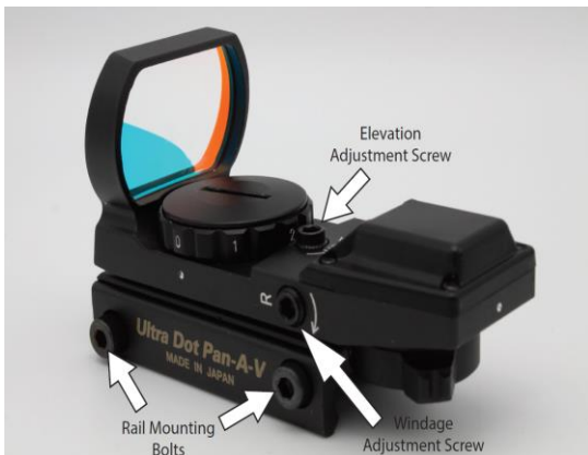
Mounting Bolt/Windage and Elevation Adjustment Locations

Model: Ultradot Pan AV Finish: Black Matte only Body Material: Aluminum Dot size: 4 MOA, 3 reticle patterns Magnification: 1X Battery: CR2032 Brightness level: 7 positions Parallax Free: 50m Length: 82mm Width: 28mm Weight: 112g W/E adjustment: 1 MOA per click adjustment Optics: Anti-reflective glass lens 33mm diagonal lens