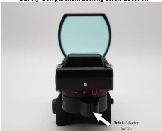
Reticle Selector Knob

To Contact the Warranty Department direct: (916) 293-9856 PST 9am to 5pm Monday - Friday Ultradotservice@gmail.com